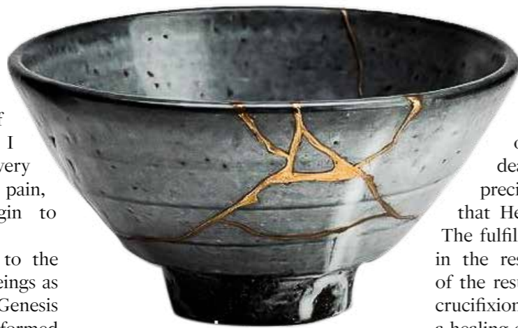
Kintsugi : The Japanese art of restoring broken pottery

I previously shared 3 reflections over Lent on subtle insights I observed through my experiences of pain. In this final instalment, I reflect on an unexpected discovery as I allowed myself to live the pain, and noticed restoration begin to emerge.